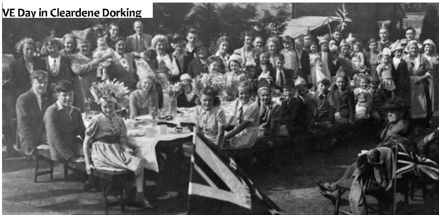
VE Day in Cleardene Dorking