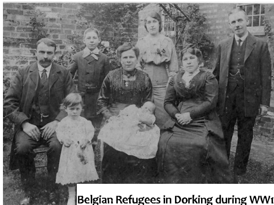
Belgian Refugees in Dorking during WW1

A Place of Safety: The Museum's summer exhibition opens on 15th May and