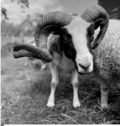
Gorgeous, waiting for his ram lambs!

One of my ram lambs, Juno, is particularly large and he now lifts his mother off her feet when he tries to suckle!