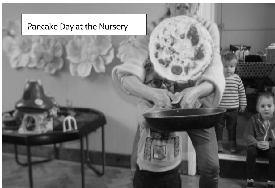
Pancake Day at the Nursery

It's been wonderful to enjoy some sunnier days and we've been out and about ambling through the churchyard looking for signs of spring. Luckily there are plentiful primroses, crocuses and snowdrops popping up all over the place for us to spot. We have even been growing our own magic beans after reading Jack and the Beanstalk. They have come home with us so we can watch them get bigger every day. Some of them are already rivaling Jack's!